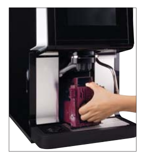
Easy to Maintain