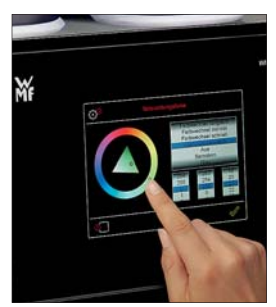
User Friendly Interface