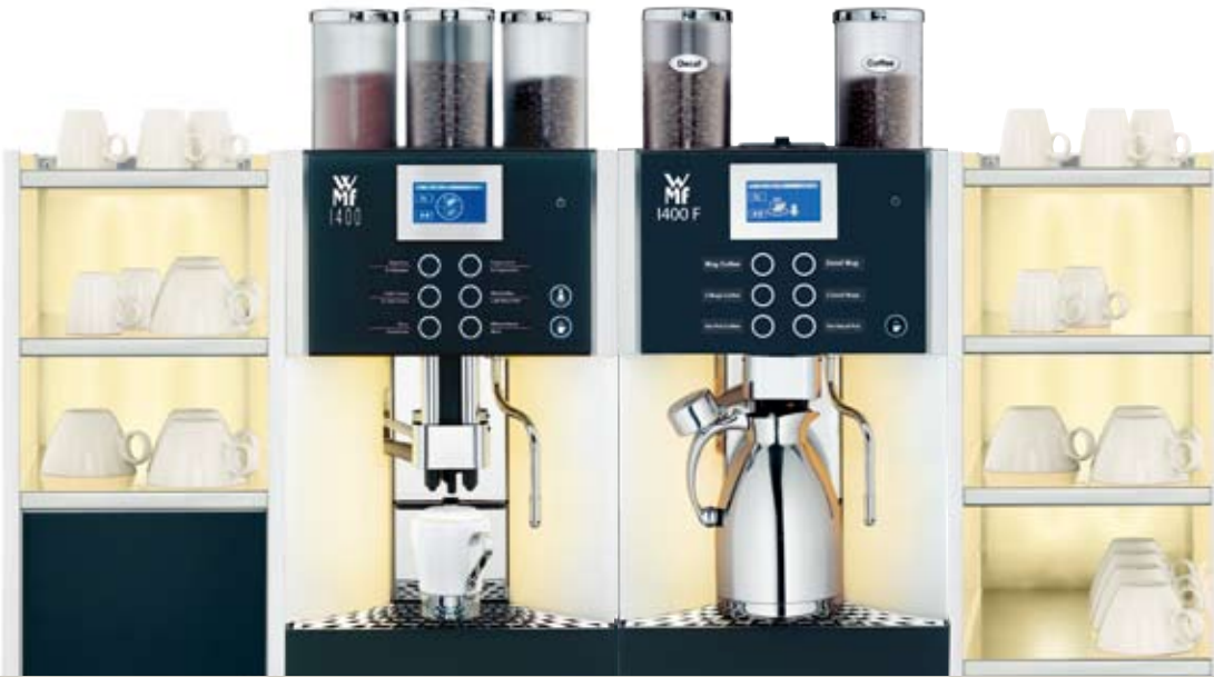
Cup & Cool

... fresh drip style coffee from Bean to Cup