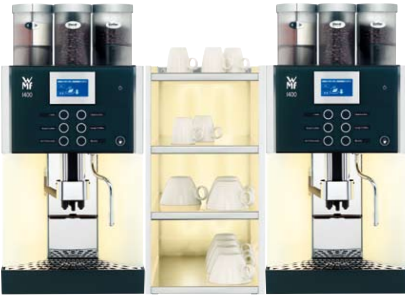
WMF 1400F OCS